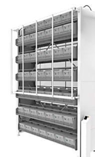
Vertical lift modules