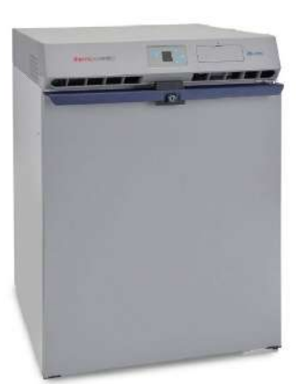
Thermo Fisher Scientific TSG505