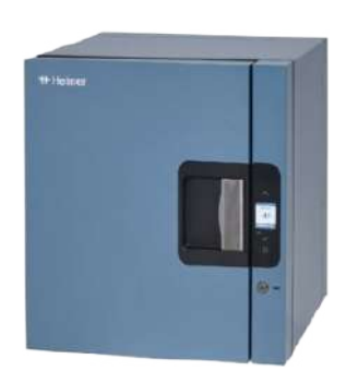
Helmer MRL 102 Countertop Refrigerator