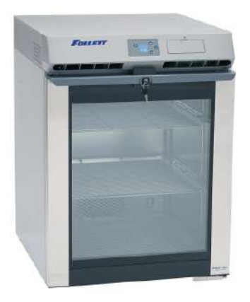
Follett Solid-State Undercounter Medical Grade Refrigerator