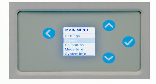
Clear intuitive displays for precise temperature control